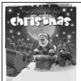
A Christmas classic - The Night Before Christmas.