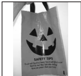
A trick-or-treat bag with a few goodies!